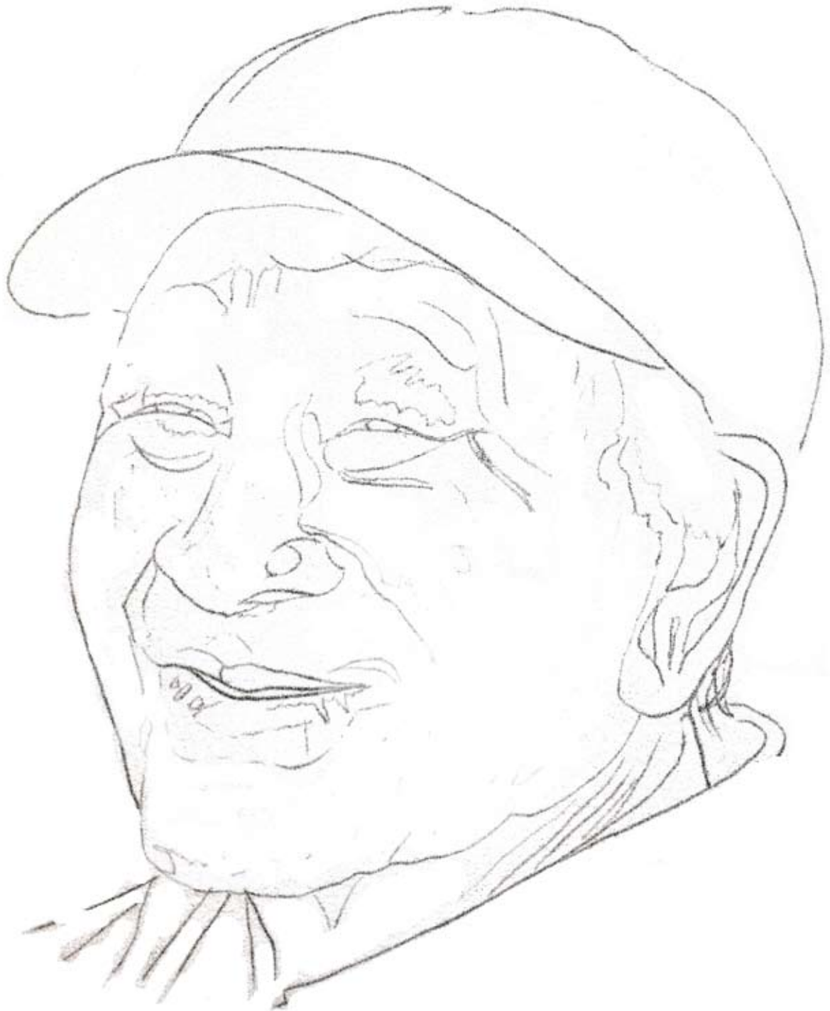
Man in Cap